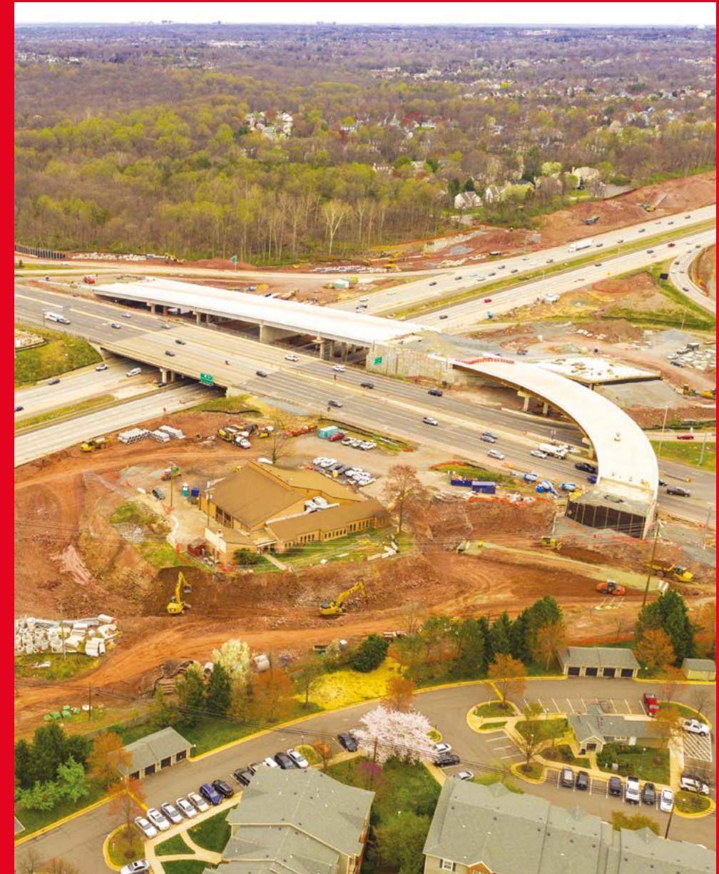
© Work was performed as a subcontractor for FAM Construction on the Transform 66 Outside the Beltway project